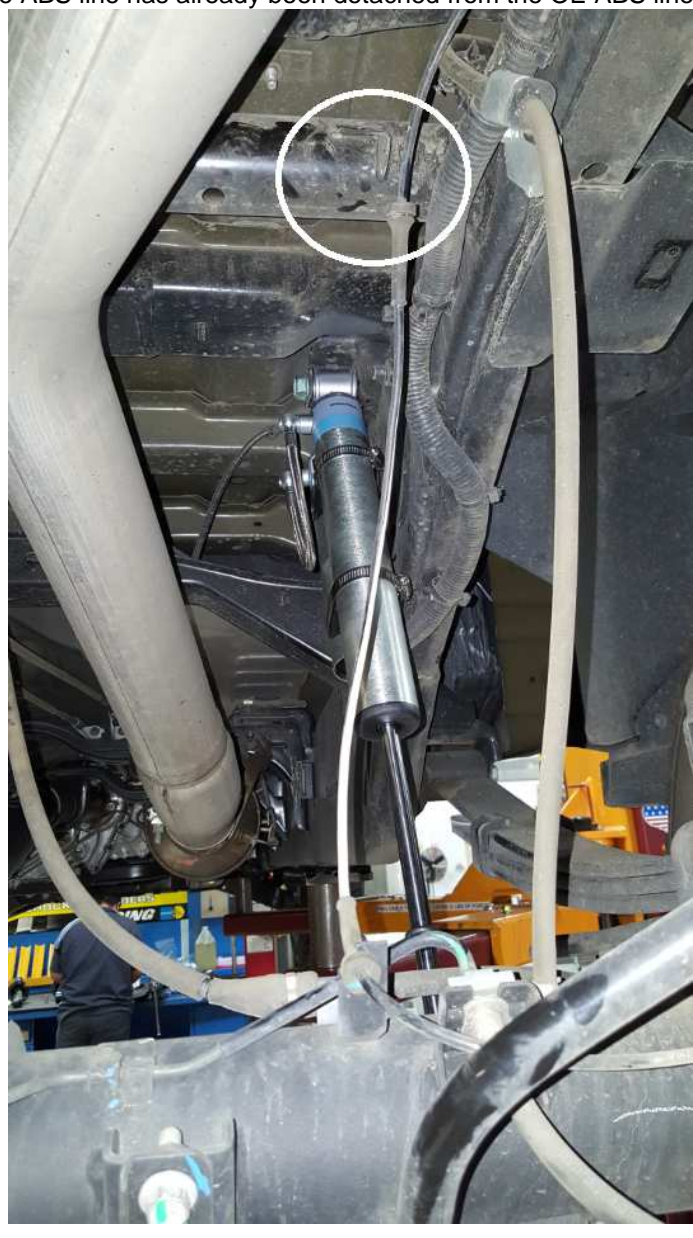
Figure 1. passenger side rear

1. Locate and detach the ABS line where it attaches to the frame on the passenger side. See the white circle in Figure 1 below and Figure 2 for a zoomed in view. In both Figures 1 and 2 the ABS line has already been detached from the OE ABS line mounting bracket.