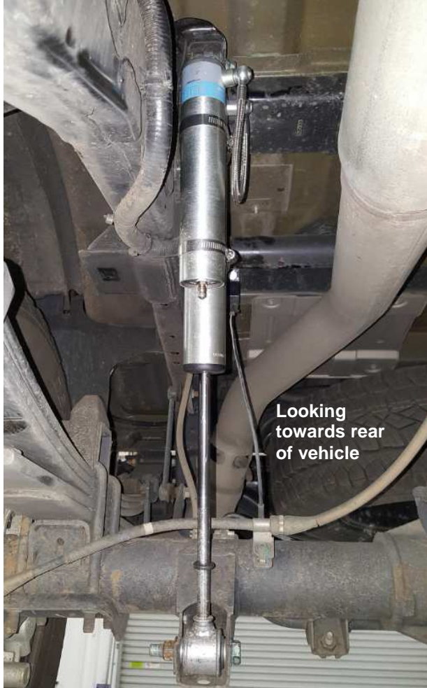
Figure 9. passenger side rear