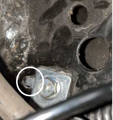
Figure 5. Breather hose bracket