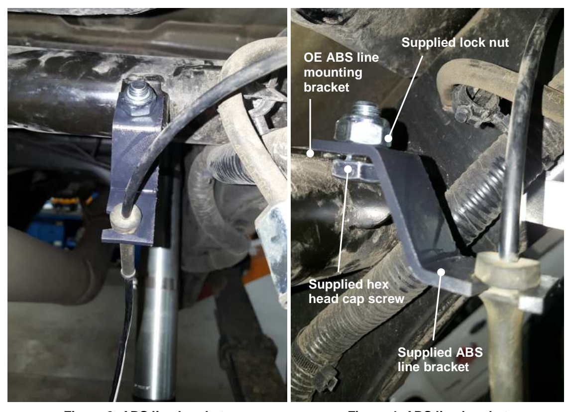
Figure 3. ABS line bracket