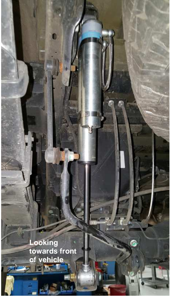
Figure 7. driver side rear